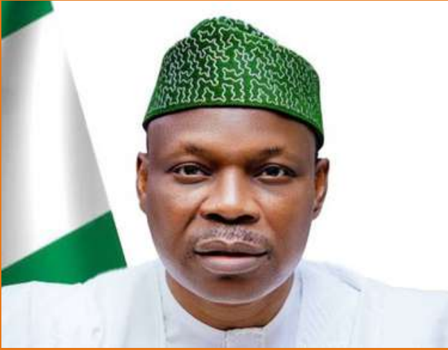
DR. IZIAQ KUNLE SALAKO

The healthcare sector in Nigeria welcomes a new Minister of State for Health, Dr. Iziaq Kunle Salako, who succeeds Dr. Tunji Alausa in the role. As he takes on this pivotal position, HFN looks forward to continued collaboration with the ministry under his leadership to drive innovation, improve healthcare access, and strengthen the health systems across Nigeria.